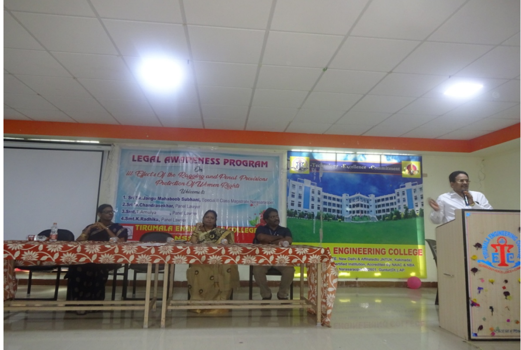
A speech by second class Magistrate of NRT at Legal Awareness Program