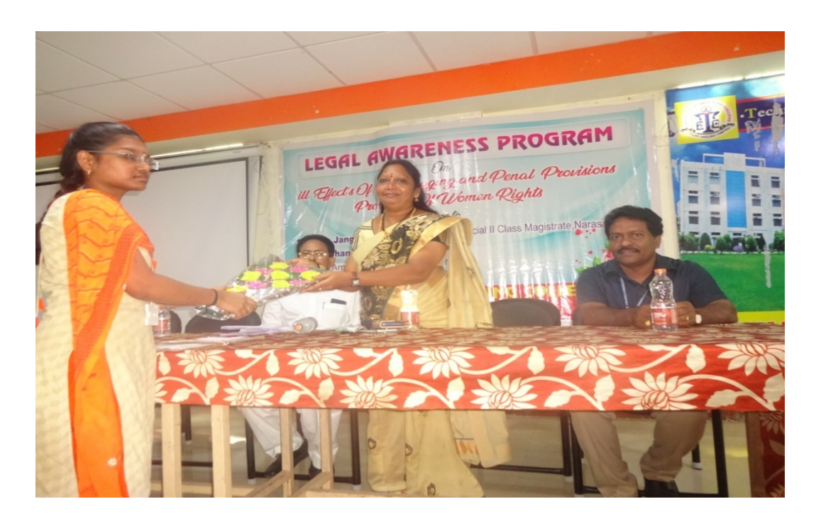
Honoring of Lawyer by girl Student