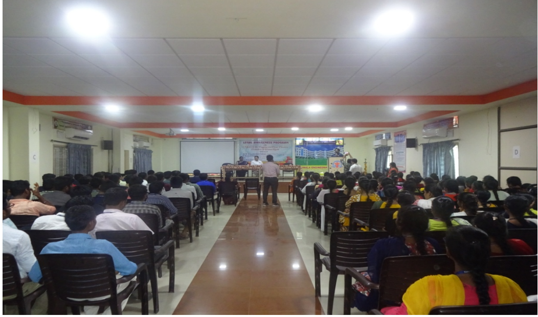
Students of TEC at Legal Awareness Program