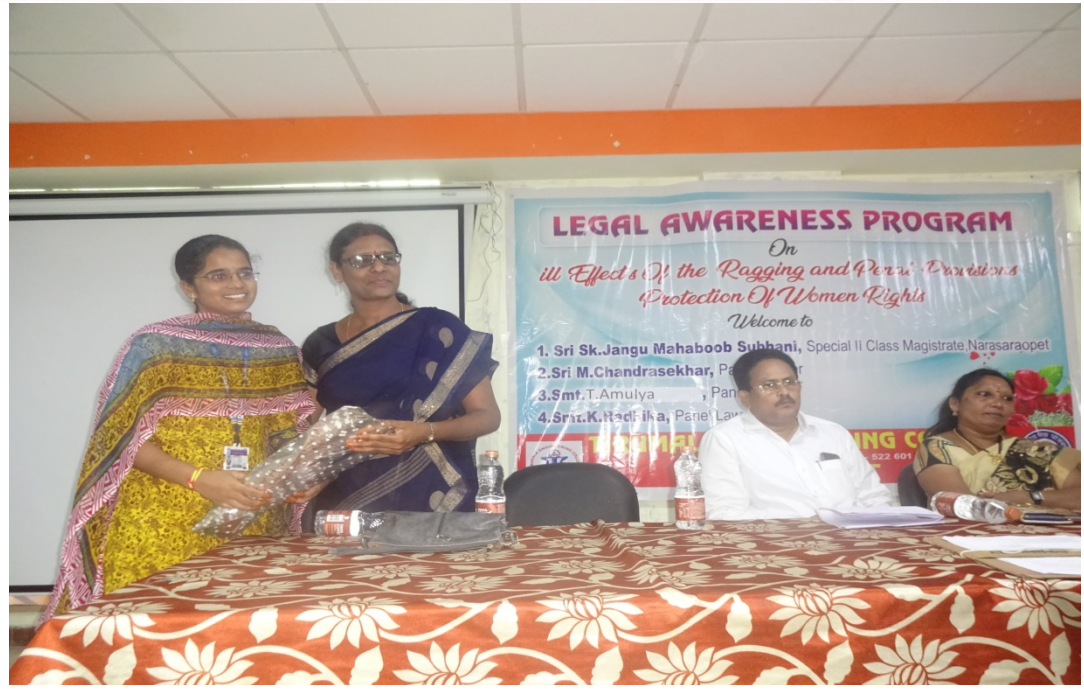
Honoring of Lawyer by girl Student