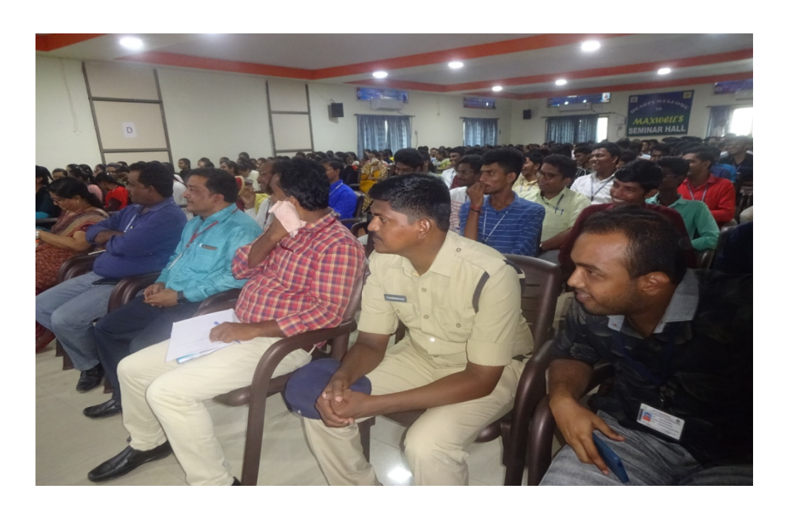
Security of Second Class Magistrate and Press Reporter